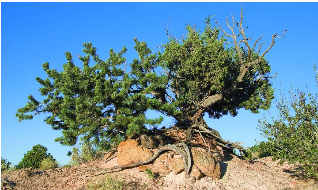
The Galisteo River Basin site which will include burial and scattering space has many examples of what Sierra Club founder John Muir called "the beautiful blendings and communions of death and life," such as this tree, which is actually a pinion and juniper intertwined around dead wood.

Is the green burial movement a threat to or an opportunity for the cemetery and funeral service profession? The director of the Green Burial Council explains how he sees the movement benefitting operators who embrace it.