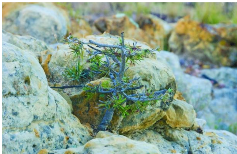
A natural bonsai tree in the Galisteo Basin Preserve that might one day serve as a marker.

The biggest opportunities for deathcare professionals wanting to get into this field may ultimately lie in co-venturing with conservation organizations to develop, operate and maintain green cemeteries. The model that’s been evolving in Santa Fe, New Mexico,