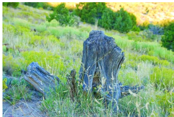
A closeup shows the color of the desert site.

Green burial may be just a variation on what most of humanity has always done for the deceased; at least until a century ago when the manufacturers of embalming fluid, who founded the nation's first mortuary schools, gave us "better death through chemistry." But I also know that what a growing